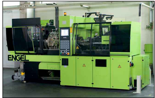
Fig. 1: Two component injection moulding machine

The production of two component composites of a hard plastic and a soft rubber is usually realized in an expensive multistage process. First of all, the plastic component is prefabricated by injection moulding. Afterwards, either bonding agents or activation treatments are applied to the surface in order to achieve a high adhesive strength between the plastic and the rubber components. Finally, the rubber component is added by a second injection moulding step. To reduce the high production costs caused by these different steps, a new single-stage process of two component injection moulding has been developed. During this process plastic/rubber composites are produced in a two component injection moulding machine without using bonding agents or activation treatments. For the high adhesive strength between the two components, diffusion of polymer chains or chemical reactions in the interface have to take place. Therefore, a system of corresponding plastic and rubber types with specific material properties is required. In addition to this material combination, process parameters like cylinder and cavity temperatures, injection and holding pressures, cooling and vulcanisation times affect the adhesive strength of the plastic/rubber composite.